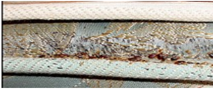
Bed bug Infestation