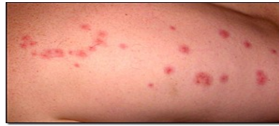
Bed bug bites are usually in a row of 3 or 4